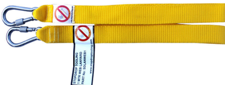
SDLANWEB , 1M WEB LANYARD, 3KG/6LBS