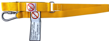
SDWSCOM1 , 1M WRIST STRAP LANYARD, 2KG/5LBS

We supply: Wrist, Web, Coil, Wire Coil, Wire, Heavy Duty Wire and Super Heavy Duty Wire Lanyards.