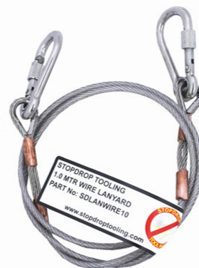
1M Wire Lanyard With Locking Screwgate Carabiners