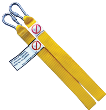
1M Yellow Web Lanyard With Locking Screwgate Carabiners